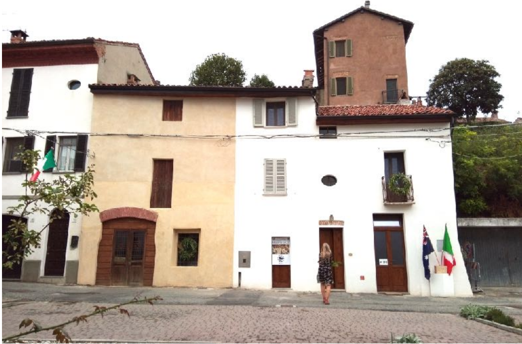
Quentin Bryce Creative residency , Via Mezzavilla 37, Conzano, Province of Alessandria, Italy